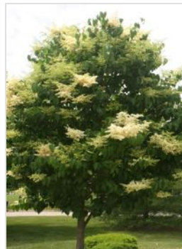
University of Michigan Herbarium

This is a sturdy, upright tree with reddish-brown, cherry-like bark that becomes gray with age. The foliage is dark green, and blooms large, creamy-white flower clusters in the late spring. Fruit presents in clusters of capsules, turning from green to brown.