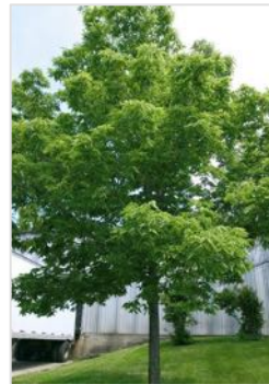
NVK Nurseries; Deep Fork Tree Farm

Magnifica Hackberry is a large, desirable tree because it resists common Hackberry diseases and it has better insect resistance than other similar species. Its lustrous green leaves turn yellow in fall. Flowers are inconspicuous.