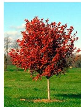
Arbor Day Foundation

The October Glory Red Maple was selected in New Jersey for outstanding fall color and uniform growth and was introduced in 1961. Shiny green leaves hold longer in fall, turn to a crimson-red color. Suited to locations where space is ample.