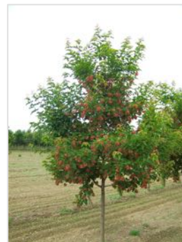
The Tree Farm, Ray Wiegand's Nursery

The Ruby Slippers Maple is covered in red samaras (helicopter seed pods) that resemble red slippers throughout the summer. The glossy, dark green leaves turn brilliant shades of red, orange and yellow in fall.