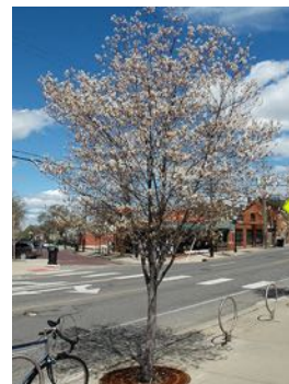
Gardeners Supply; FK Nursery

The Robin Hill is an upright Serviceberry with dense foliage of bronze-tinged green leaves, which turn yellow to red in fall; attractive, faintly pink flowers in April which fade to white; and small, red to purple fruits which are attractive to birds.