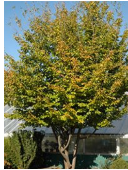
Morton Arboretum; Monrovia

This four-season tree is upright and columnar with branches that arch outward toward the tip. They bear a canopy of oval-shaped, lustrous leaves which emerge bronze and burgundy in the spring, mature to dark green in summer and turn crimson, orange and gold in the fall. Small, spidery red flowers are produced on bare stems in the winter.