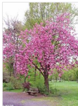
Arbor Day Foundation

Made famous by the Washington D.C. cherry blossom displays, this tree is valued for its beautiful dark pink blossoms and vase-shaped growing habit. Leaves emerge reddish copper in the spring, turn dark green in the summer and orange-brown in fall.