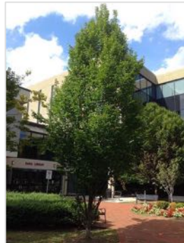
University of Vermont; Morton Arboretum

The American Hornbeam is a single- or multi-stem tree with a sinewy trunk and bluish-grey leaves. Leaves are bluish, green and turn yellow, orange and dark red in the fall. Flowers are white if female and yellow-green if male, with nutlets in a leafy cluster.