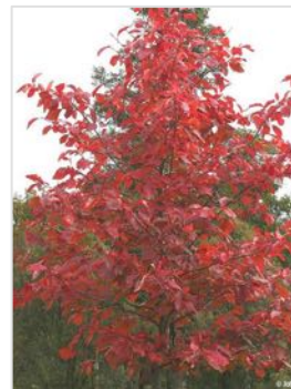
Arbor Day Foundation

Summer leaves are a dark green with a high-gloss appearance, but the most spectacular part of this tree is the fall foliage with many shades of yellow, orange, bright red, purple or scarlet that may appear on the same branch. Bark matures to medium gray and resembles alligator hide. Fruit is bluish-black and is loved by many birds.