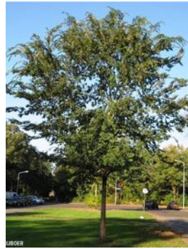
Arbor Day Foundation

This graceful elm has a high degree of urban tolerance, making it a wonderful city shade tree where a larger tree is needed. It's leaves are dark green in the summer and yellow to wine color in the fall. Its distinctive bark is mottled, creating colorful patterns in its trunk.