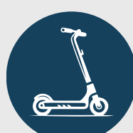
E-bikes & e-scooters