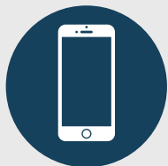
Phones & tablets

Rechargeable batteries are found in many commonly used household items.