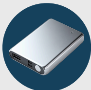
Portable power banks