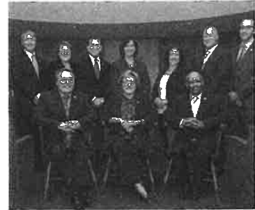
MAYOR Nora G. Radest

ECRWSS EDDM POSTAL CUSTOMER SUMMIT, NEW JERSEY 07901